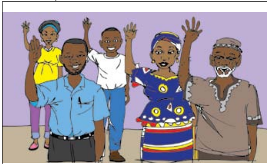
Nominate and elect/select members of the Interim Coordinating Committee

GUIDANCE: Meetings should include information about the following: the Land Rights Policy, the proposed Land Rights Act (LRA), the proposed LRA procedures for securing legal recognition of community land, the community self-identification process: including purpose, activities, implementation schedule, and duration, the roles and responsibilities of community members and leaders, the election or selection of the members of an interim coordinating committee: including animators that will help to continuously mobilize the members and leaders of the community to support the community self-identification process and to attend all meetings related to the community self-identification process and an agreement on the schedule of the next activity: date, venue and time