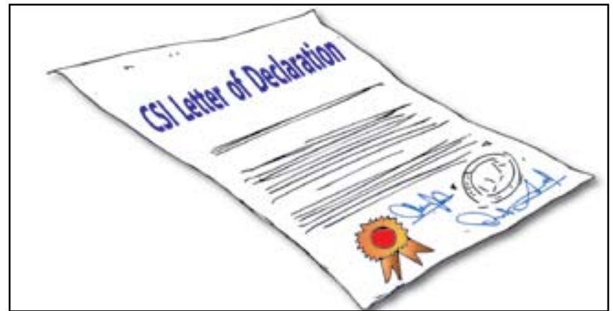
Signing of CSI declaration

Communication/letter indicating the completion of all activities of CSI process.