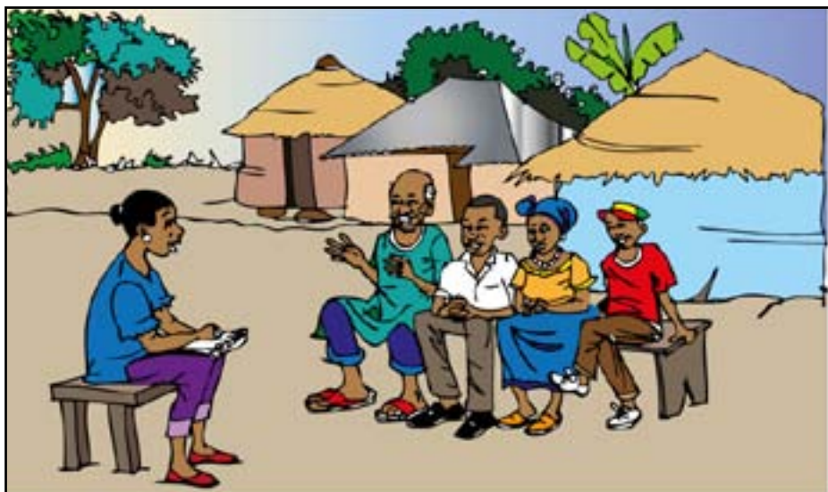
Conduct key informant interviews with key community members.

5.1.2 Conduct key informant interviews with key community members