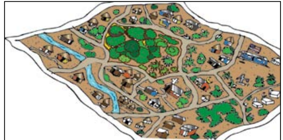
Preparation of sketch map indicating all features.

5.4.1 Conduct community participation and consultation meetings to identify community land area in a way that it reasonably maximizes the participation of the community